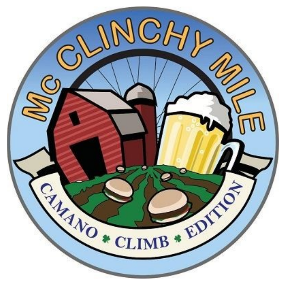
March had many great rides! Thank you to all who posted photos of what we love to do...RIDE OUR B.I.K.E.S.!

If you would like to see your pictures in the newsletter you can send them directly to <a href="mailto:editor@bikesclub.org">editor@bikesclub.org</a> or post them on the <a href="mailto:BIKES Club Facebook Page">BIKES Club Facebook Page</a>!