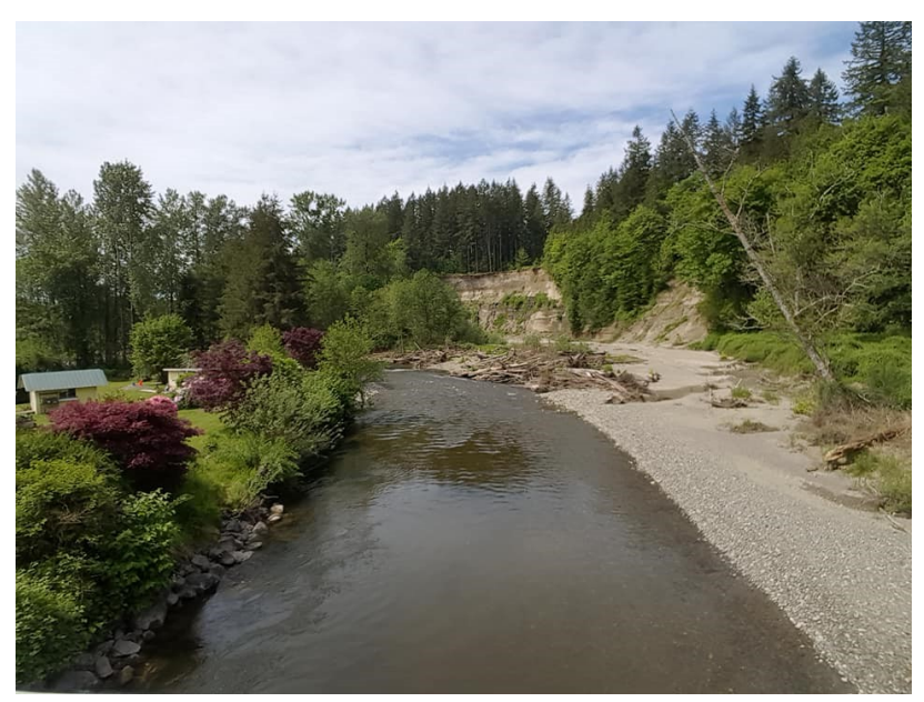
Happy Birthday Dan...Old Man River!