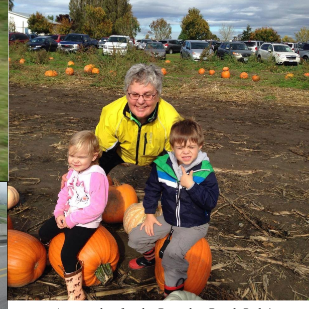
A great day for the Pumpkin Patch Ride!