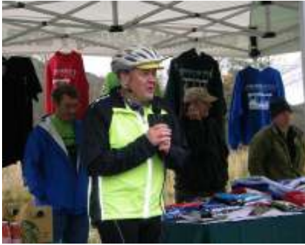
& Ribbon cutting