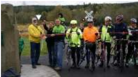
followed by rides from the Nakashima Barn at the North terminus of the trail. 11/3/2012